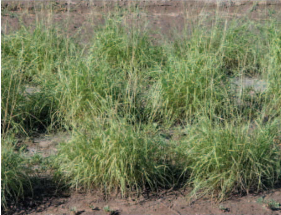
Figure 5. Field evaluation of different genotypes (individual plants) of whiplash pappusgrass ( Pappophorum vaginatum Buckl. [Poaceae]) from a single population in an experiment at the USDA Natural Resources Conservation Service, Tucson Plant Materials Center.

to reductions in fitness. Occurrences such as this represent the most common type of genetic pollution that may be associated with revegetation projects with native plants. Still, simple introduction of a non-adapted ecotype in the absence of significant hybridization with local ecotypes could also be thought of as an example of genetic pollution.